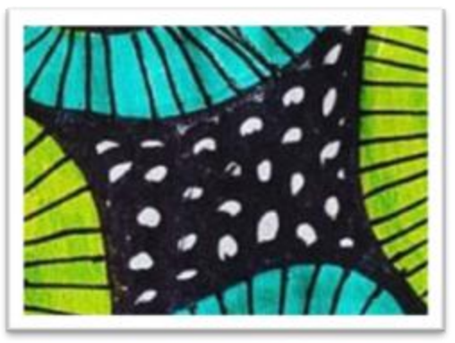
5. Using a black felt pen, draw liny circles in the white spaces. Leave the interior of these circles

5. With a black pen, draw this graphic design in the interior of the circles.